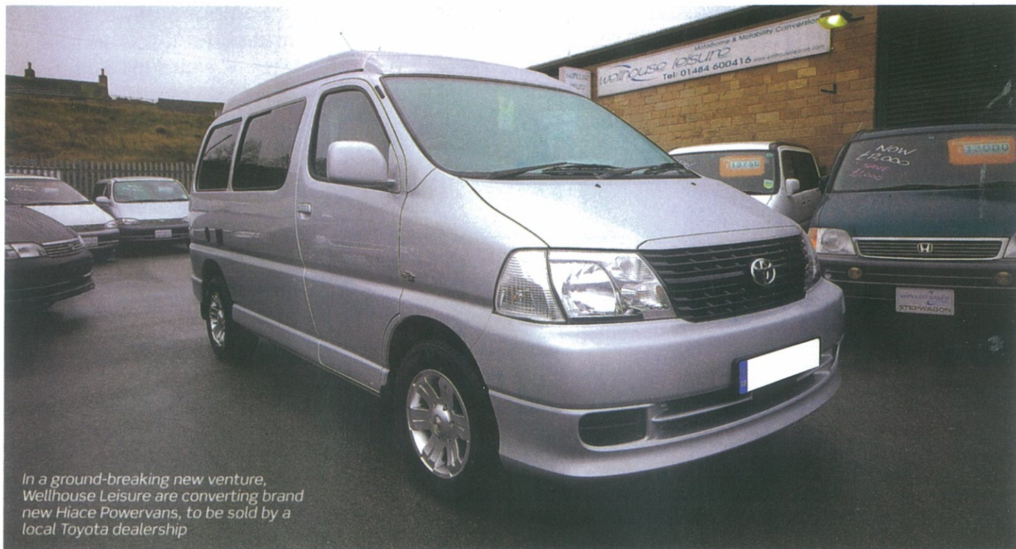
In a ground-breaking new venture, Wellhouse Leisure are converting brand new Hiace Powervans, to be sold by a local Toyota dealership