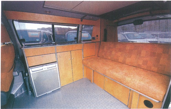
The spacious front lounge that has been created for the new Toyota Townace Powervan (see main pic on left)