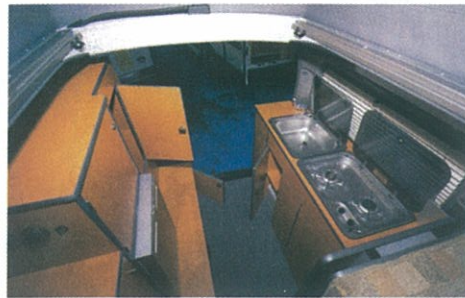
Plenty of standing room allows easy access from Regius front lounge to the rear kitchen