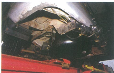
Dual-fuel LPG conversions give the price equivalent of 40mpg and extend your range