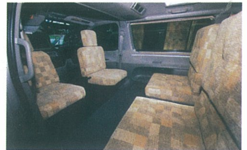
Stretch out in comfort in the Regius lounge, which provides two single beds or a double

vehicle. Even though the increasingly disadvantageous exchange rate against the Yen is forcing up base vehicle prices, you will currently find discounts of £1,000 off much of the existing stock, making some genuine bargains available. Be aware though, that these discounts will only be available on vehicles currently on the premises, so you will need to make your mind up pretty quickly if you want to take advantage.