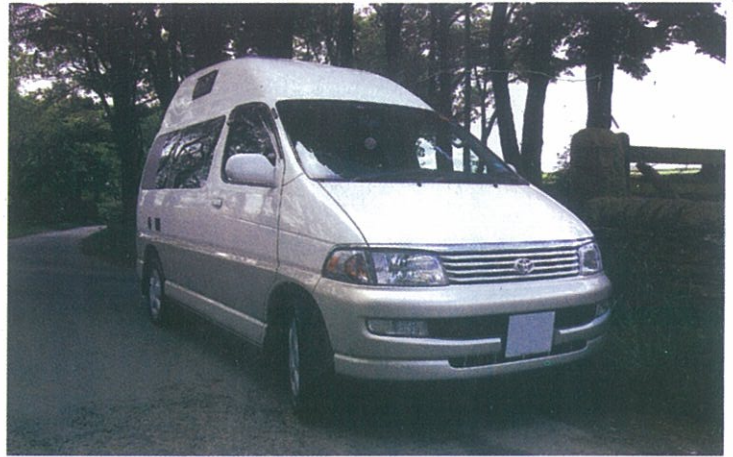
The Regius is highly popular version of the sophisticated Hiace, with a narrower width that fits more easily on restricted driveways