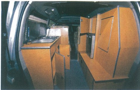
The Regius kitchen is accessible from the rear and leaves space to store an awning