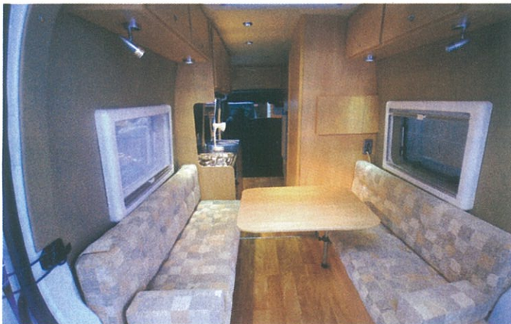
A home from home - the Renault Master's accommodating lounge, lit by an abundance of well placed mood lighting