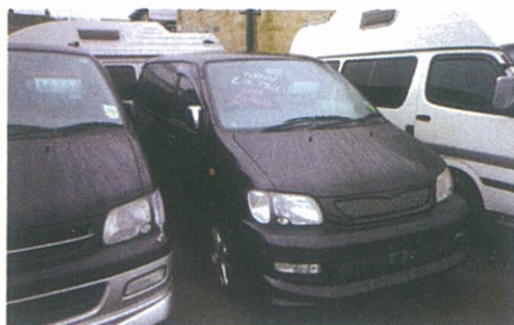
Beat future price rises with £1,000 off many stocked vehicles, including this Toyota Noah

brand new Hiace Powervans, which will be converted and sold in their own showrooms. In yet another move to keep ahead of the pack, Wellhouse Leisure can now carry out conversions of petrol vehicles to run on LPG. It will cost you £1,800 to have your own vehicle converted, but this is reduced to only £1,200 if it is to a conversion bought from Wellhouse Leisure. A customer has achieved the price equivalent of 40mpg on a 4WD Toyota Regius, so you can obviously make worthwhile long-term savings. If you frequently have occasion to travel within the London Emission Zone, the potential savings are even greater, as you will be exempt from congestion charges. These are dual fuel conversions, so there is no need to worry about running out of gas and you might also find it an added advantage on occasion, to extend your range before re-fuelling. Wellhouse has recently produced a rear kitchen conversion for the Regius, allowing a front lounge in which it is large enough to stretch out in comfort, with the option of providing either two single beds or a double. The conversion allows access through the rear doors. The vertically rising pop-top provides plenty of head room and creates a spacious feel out of all proportion to the size of the