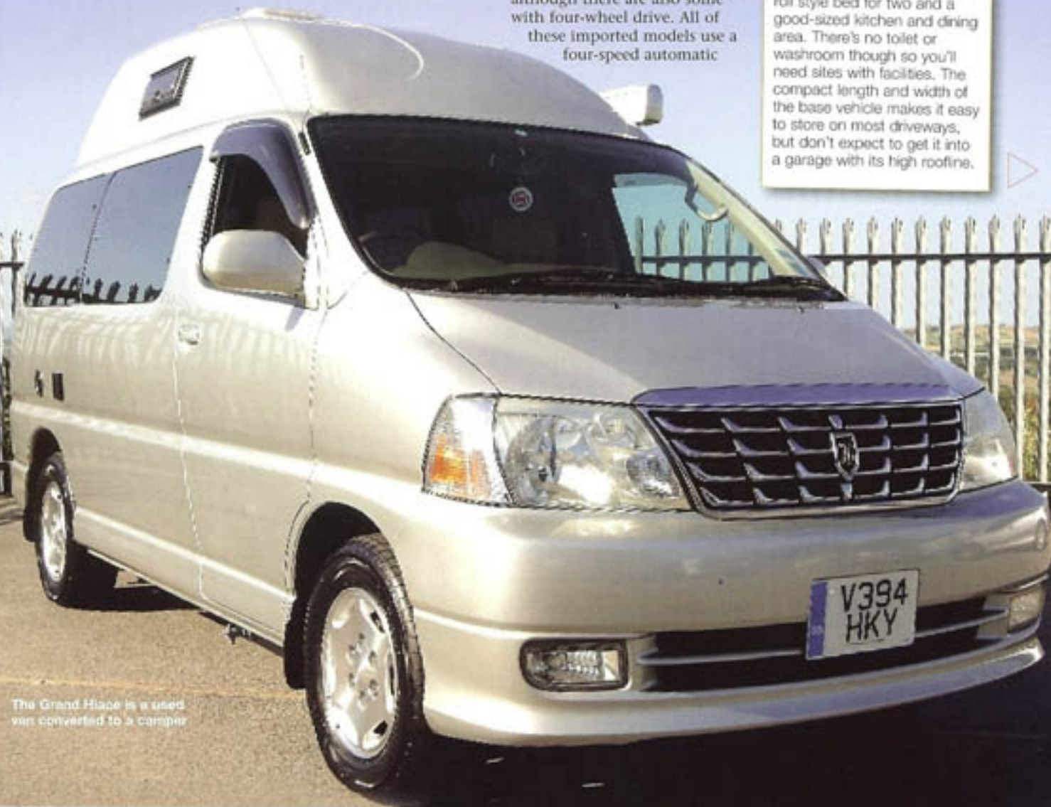
The Grand Hiace is a used van converted to a camper

This Hiace conversion, by Wellhouse Leisure, offers lots of storage space, a rock-and-roll style bed for two and a good-sized kitchen and dining area. There's no toilet or washroom though so you'll need sites with facilities. The compact length and width of the base vehicle makes it easy to store on most driveways, but don't expect to get it into a garage with its high roofline.