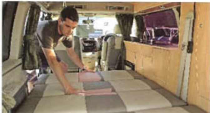
A spacious double bed is the only berth in the Reimo GRP roof version