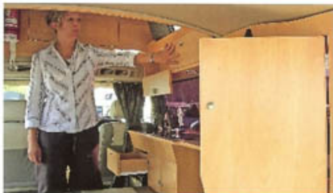
Headroom in the Wellhouse conversion is impressive